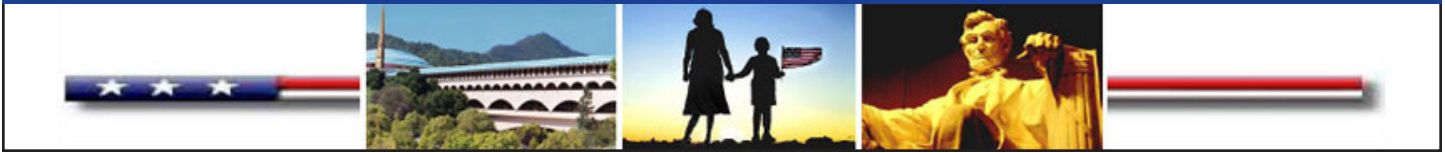
Awards 2011: NFRW Diamond Award Club