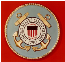
US Coast Guard